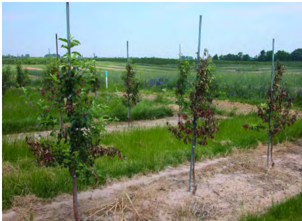
Fire blight affects the blossoms of fruit trees, causing blossom blight and infecting the emerging fruit. MAES scientists have identified alternatives to streptomycin that can control the disease.

These genes can be used as markers in breeding programs to rapidly identify fire-blight-resistant lines.